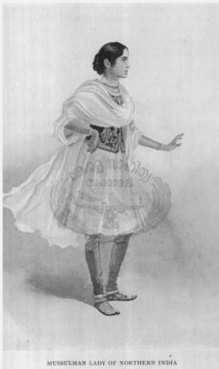
MUSSULMAN LADY OF NORTHERN INDIA